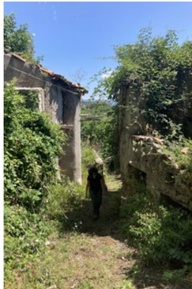
Figures 13-16. Canolo Vecchio, Reggio Calabria.