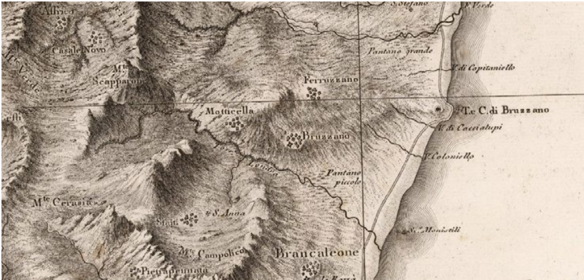
Figure 4. Particular of a map of the Ionic Southern area of Calabria with toponyms that testify to the creation of swamps along the coast (Carta Austriaca del Regno di Napoli di Rizzi Zannoni, 1847).

downstream also made the sandy alluvial fan on the shore impermeable, creating swamps along the coast. The toponymy of the entire area testifies to this phenomenon: there were many places with names evoking marshy contexts, such as giunghi , giungheto , canneto , (reeds, cane thicket), pantano (quagmire), and lacchi (lakes) 29 . Some of these places still maintain old toponyms referring to malaria, such as the area of Pantano Piccolo (small quagmire) between Bruzzano and Brancaleone and Pantano Grande (big quagmire), in the terminal stretch of the Bruzzano riverbed 30 (fig. 4).