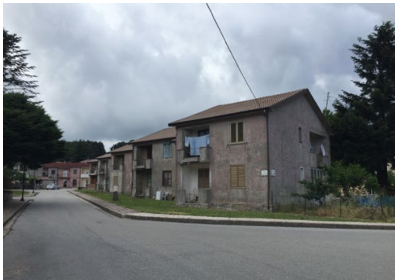
Figures 11-12. Canolo Nuova, Reggio Calabria