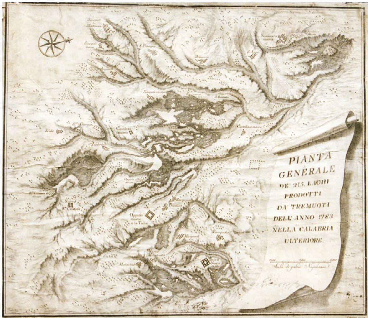
Figure 3. Map of Calabria with the lakes formed after the 1783 earthquake ( Carta geografica della Calabria con i laghi formati dopo il terremoto del 1783, di Stile Ignazio, Cataneo Aniello - sec. XVIII ).