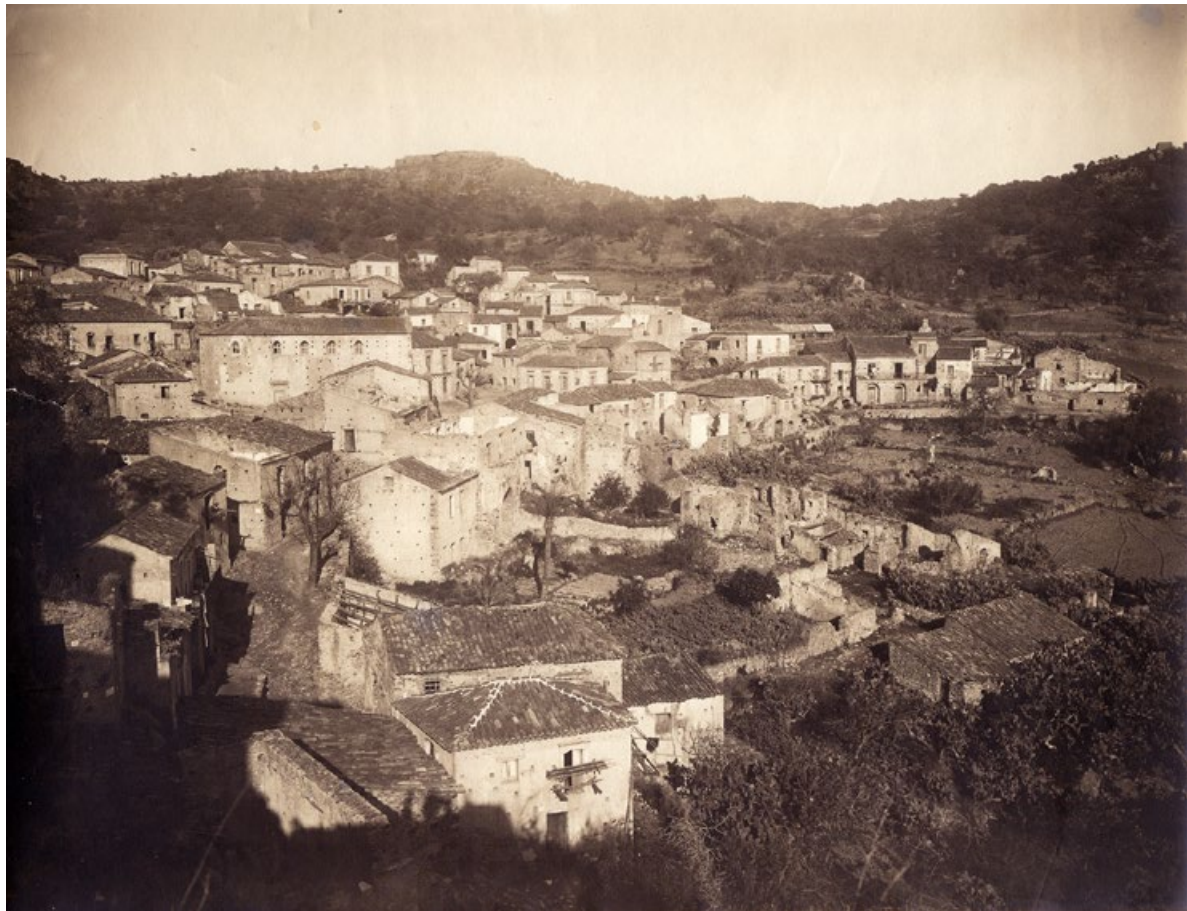
Figure 7. Bruzzano in 1920s.