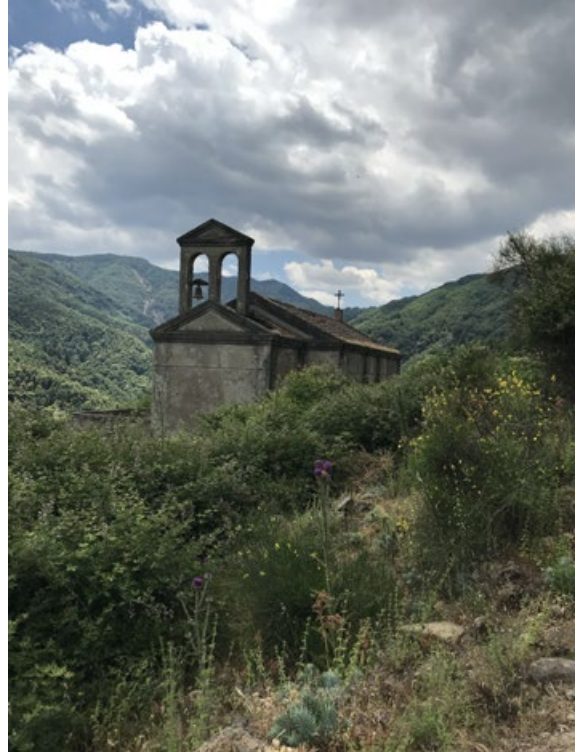
On this and in the next page, figures 17-19. Africo Vecchio, Reggio Calabria.