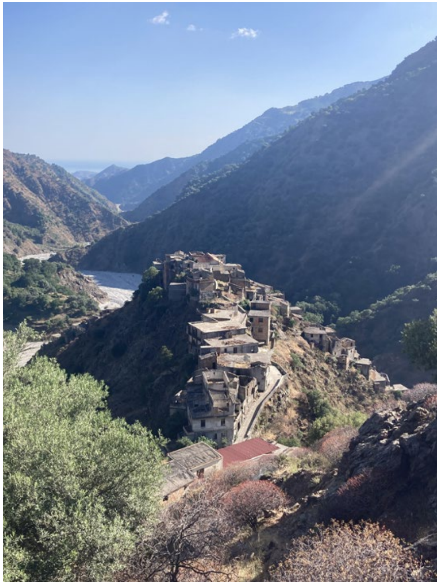
Figure 22. Roghudi, Reggio Calabria (photo N. Sulfaro, 2022).