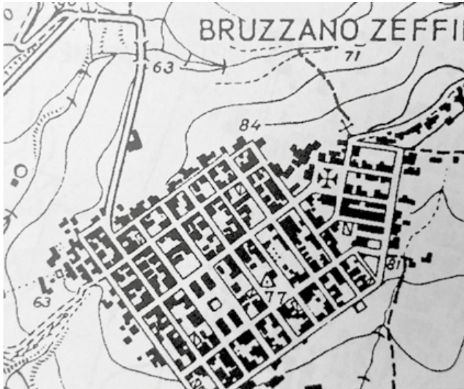
Figure 8. Map of the new town of Bruzzano Zeffirio, Reggio Calabria.