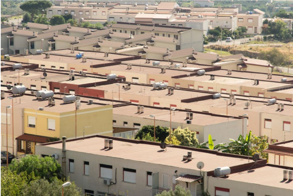
Figure 23. Roghudi Nuovo, Reggio Calabria.