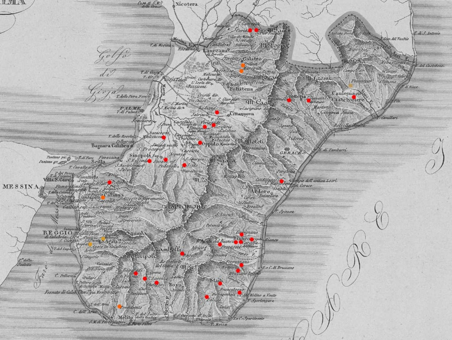
Figure 6. The settlements to be moved in the province of Reggio Calabria according to Law n. 445, 9 th July 1908 (Provisions for Basilicata and Calabria). In red are the small towns listed in Table E in 1908; in orange in 1911; in yellow in 1913 and 1916 (elaboration by the author).