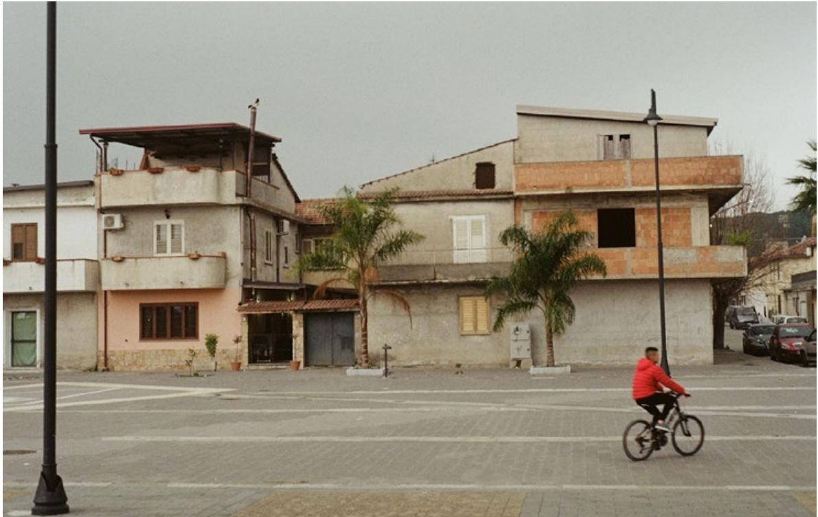
From the top, figure 20. Africo Nuovo, Reggio Calabria; figure 21. Africo Nuovo in a frame from the movie "Anime nere", directed by Francesco Munzi, 2014.