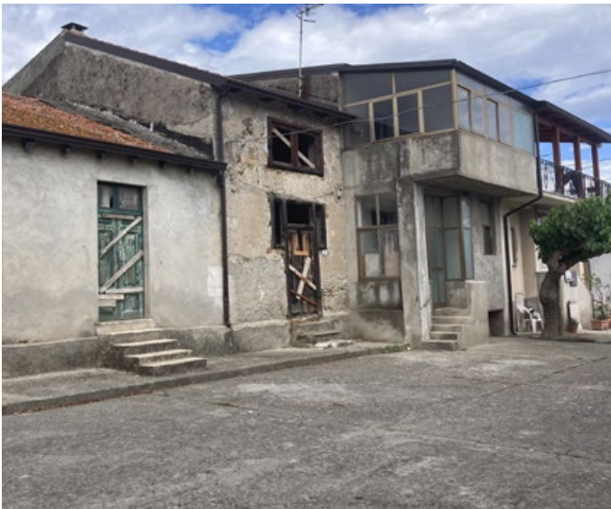
Figure 9. Bruzzano Zeffirio, Reggio Calabria (photo N. Sulfaro, 2022). On the next page, figure 10. Bruzzano, Reggio Calabria. The ruins of the old settlement (photo N. Sulfaro, 2022).